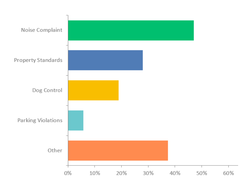
Answered: 465 Skipped: 880

It is worthy to note that seventy-five percent of complaints were related to either noise or property standards concerns which reinforces the data provided by question 5.