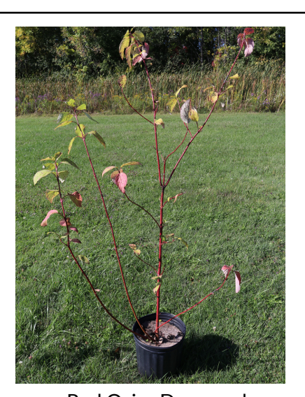
Red Osier Dogwood

Soil Depth: Thrives in medium to deep soil.